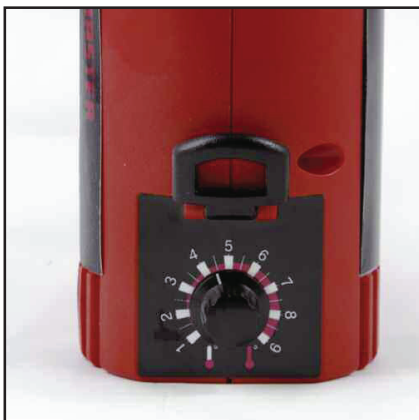
Easy access variable temperature control