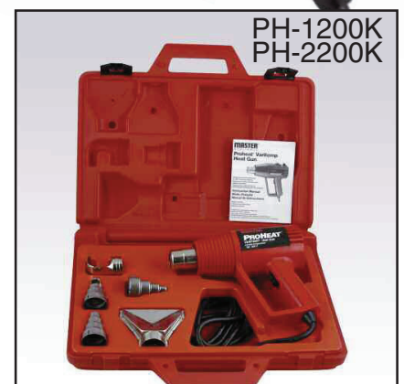
Complete heat shrink system